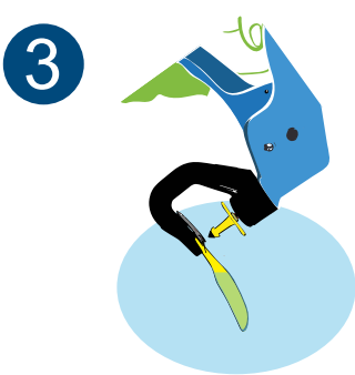
Dip jaws of applicator holding tag into antiseptic or disinfectant solution. NB: Use disinfectant at recommended dilution ratios. Failure to do so may cause irritation.